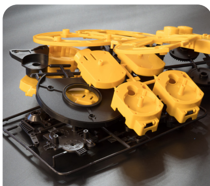
Plastics processing industry