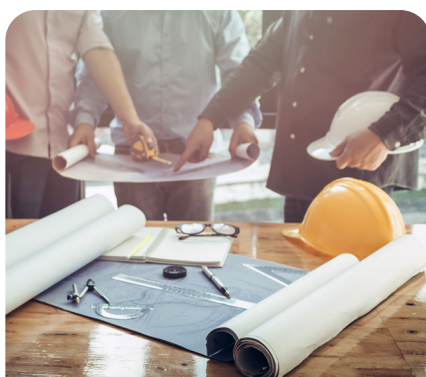
Construction, infrastructure & installation engineering