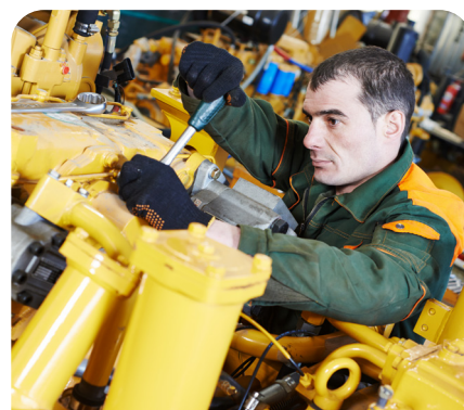
Equipment & machine construction