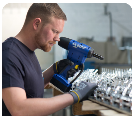
Metal processing industry

to industrial customers as well as through technical wholesalers. We advise and support customers in a wide array of market segments: