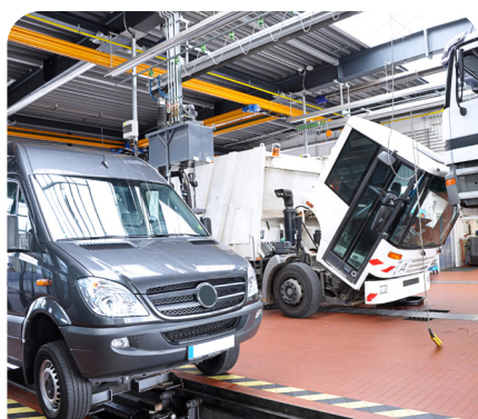
Automotive & transport industry