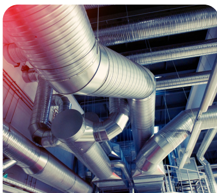
HVAC (climate technology)